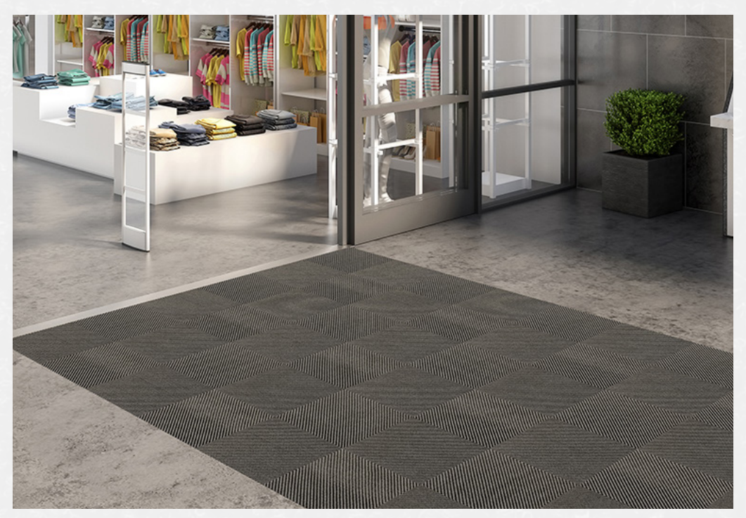
Designed to be laid with a quarter turn, these tiles create entryways that are as beautiful as they are durable.

Wyoming and Montana entryway carpet tiles deliver unmatched protection against Mother Nature's roughest elements. The hardwearing carpet tiles are ideal for regions with harsh conditions that bring salt, sand, and extreme moisture. The highly durable blend of polypropylene and polyethylene terephthalate (PET) withstands high-traffic and is resistant to debris encrusting the fiber.